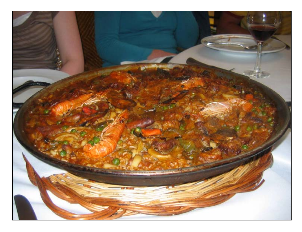
Main-course was Paella.

On Saturday we met our group at Catalunya place and we toured the city. We ate traditional dinner at restaurant.