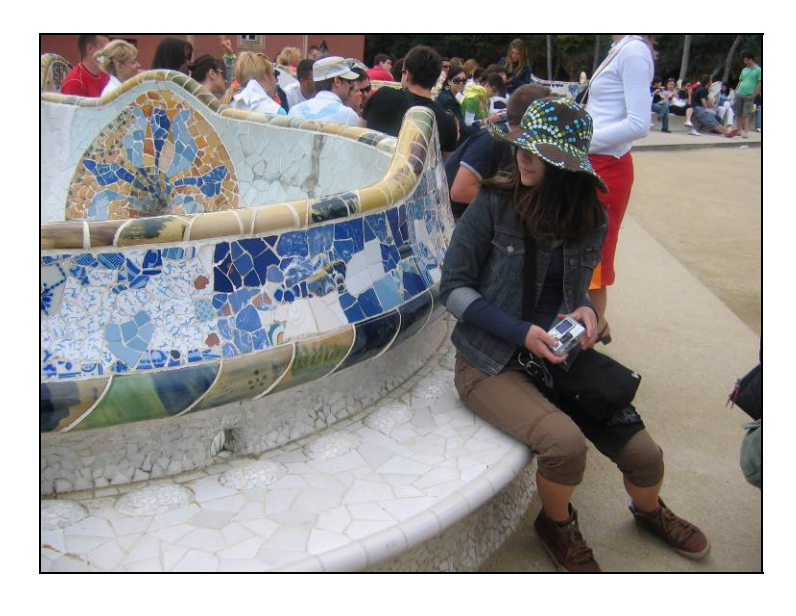
Next we drove to Gaudi's park .In the park we were very impressed with his very long bench.