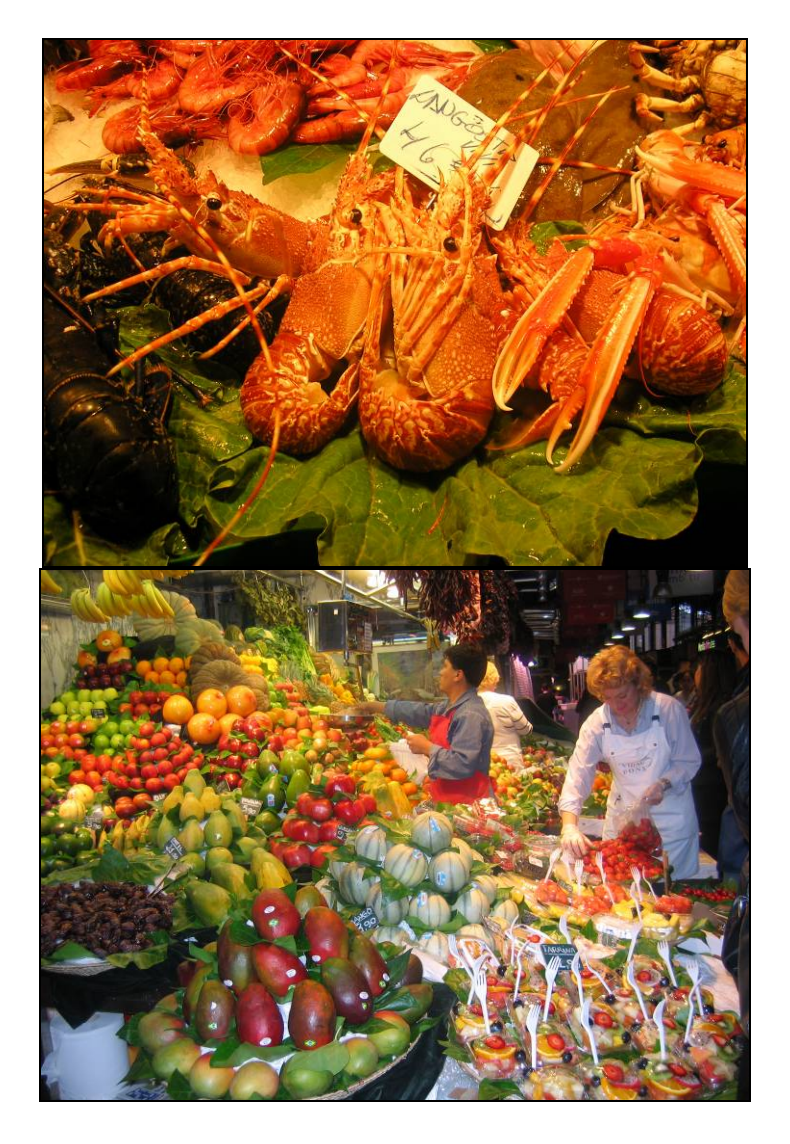
After the dinner we went to market with food.